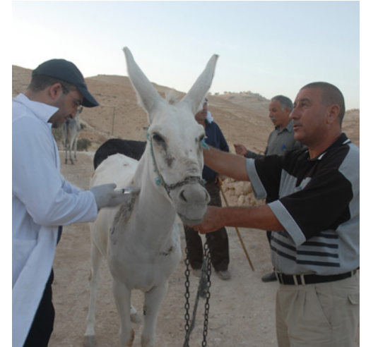
Improving the welfare of working equines