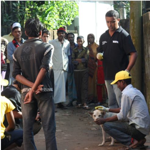
Humane stray animal control training